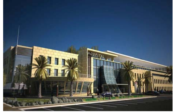
Dar Al Shifaa Hospital Khalifa City A