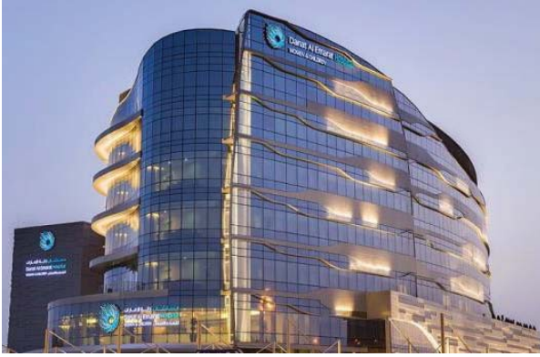
Danat Al Emarat Hospital for Women & Children