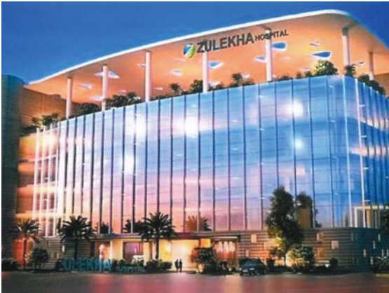
Zulekha Hospital Al Qusais, Dubai