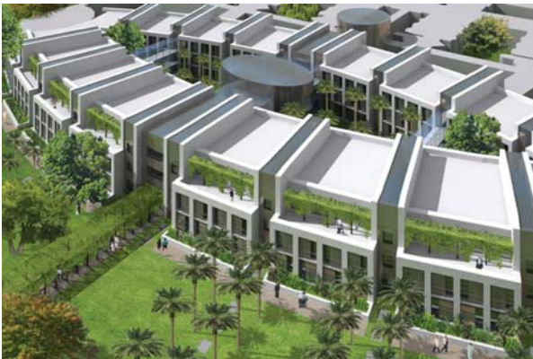
Al Wasl Maternity Hospital, Dubai