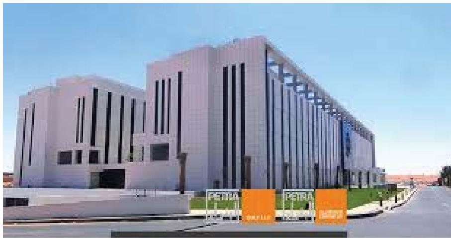
Maleeha Military Hospital, Sharjah