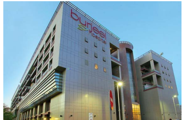
Burjeel Hospital Abu Dhabi

Contact : Haroon Architectural Hardware Company Office 1902, Aspect Tower, Tower D, Business Bay, Dubai Tel : +971 4 453 9776 Fax : +971 4 453 9774 Email: enquiry@haroonco.net Website: www.haroonco.com