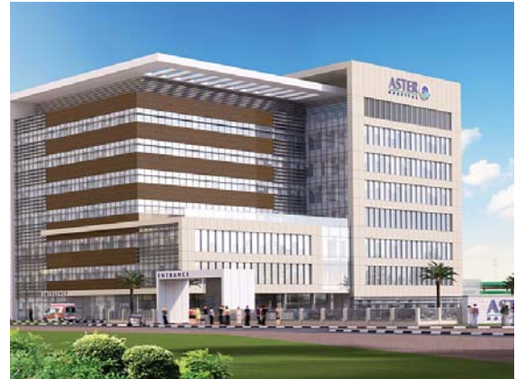
Aster Hospital Muhaisnah, Dubai