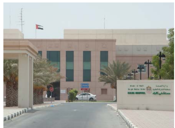
Kalba Hospital Sharjah