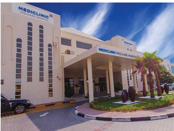
Mediclinic Welcare Hospital Garhoud, Dubai